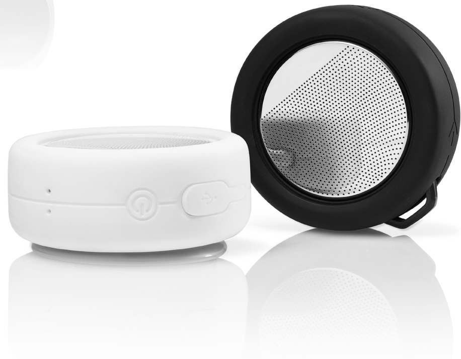
this page: wireless bluetooth speaker IN026 • wireless bluetooth speaker IN032 opposite page: wireless bluetooth speaker IN027