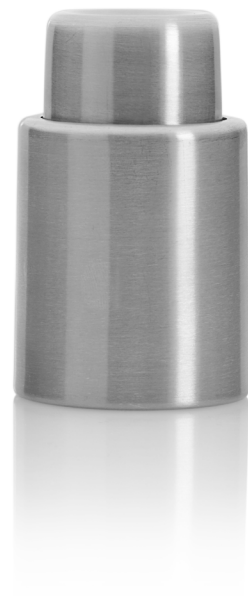
this page: champagne cork IN007 • wine cork IN012 opposite page: wine air pump IN008