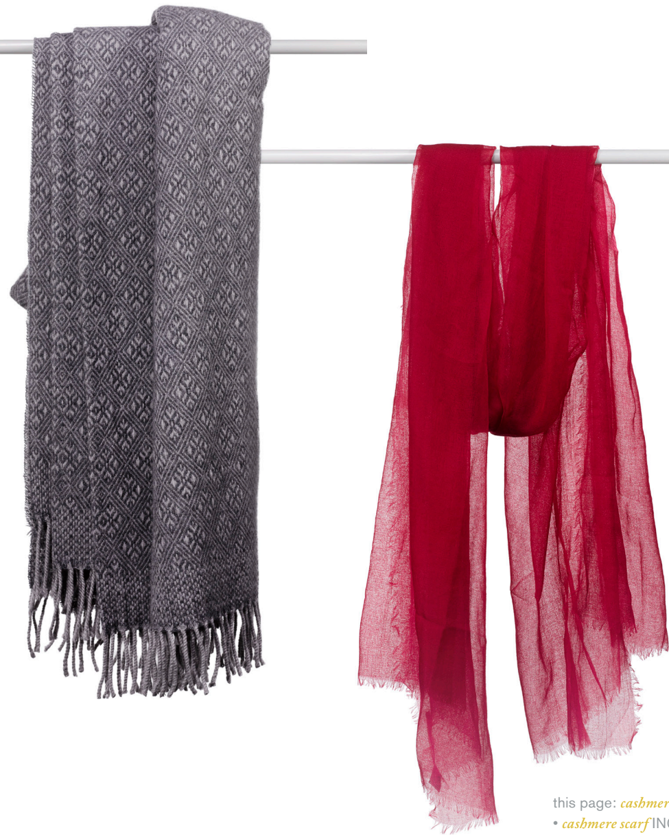
this page: cashmere blanket IN015 • cashmere scarf IN003 opposite page: newspaper tote