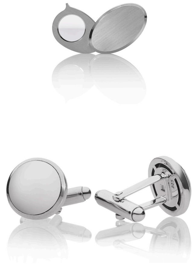
this page: elephant keychain IN013 • magnifying glass IN018 • cufflinks IN016 opposite page: umbrella w/ inside print IN019