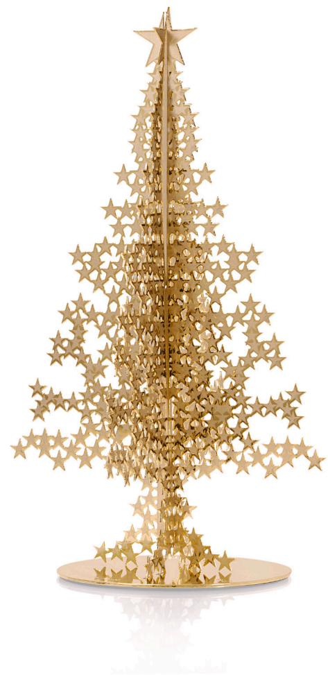
this page: christmas tree IN020 opposite page: christmas box concept IN022