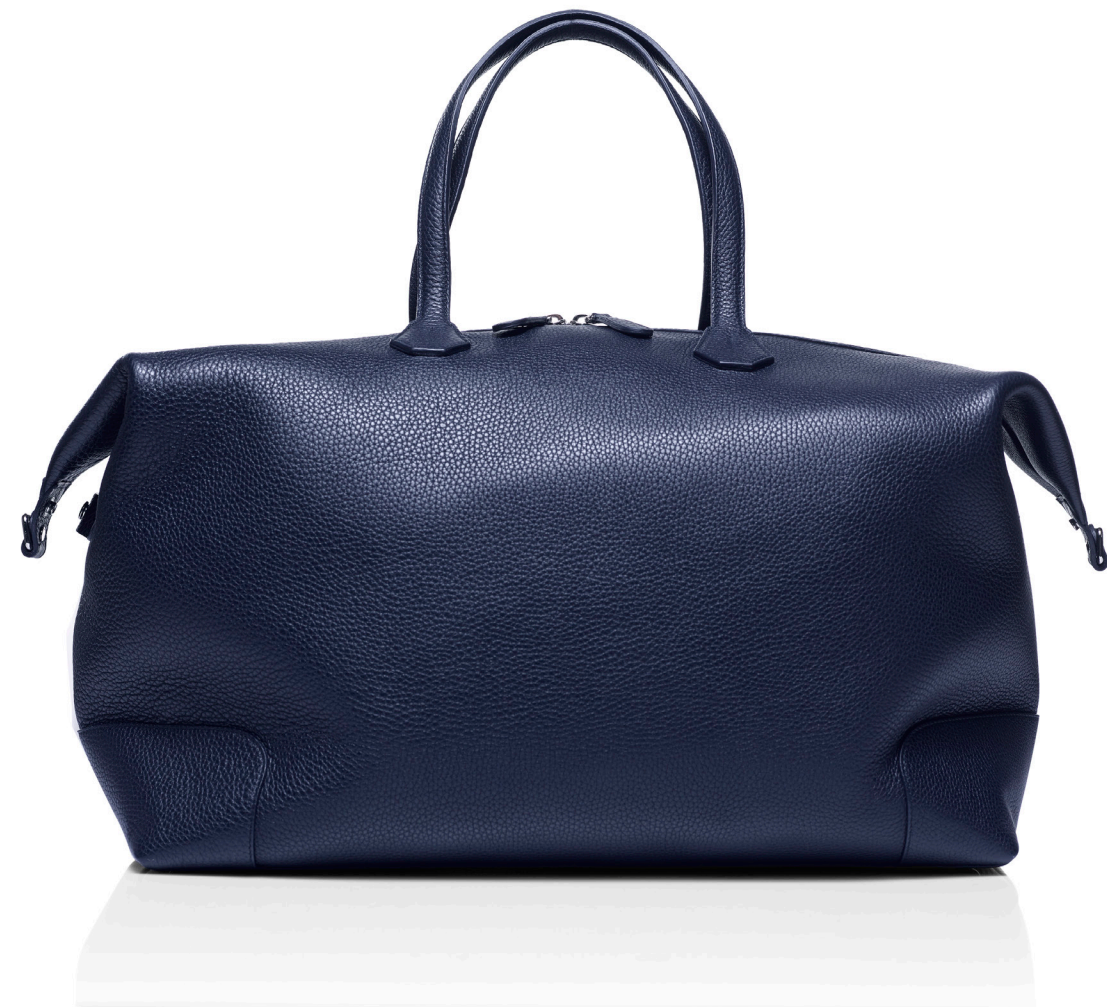
this page: weekender bag IN048 opposite page: laptop carrying case IN056