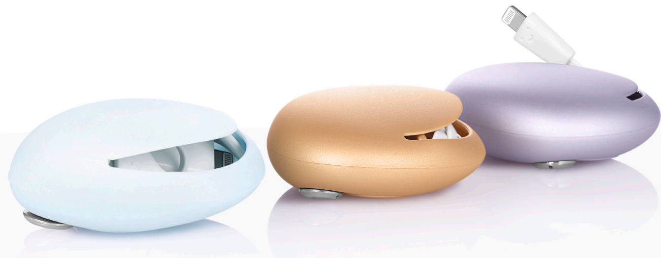
this page: plug adapter IN030 opposite page: power bank & handwarmer IN029 • power bank IN033