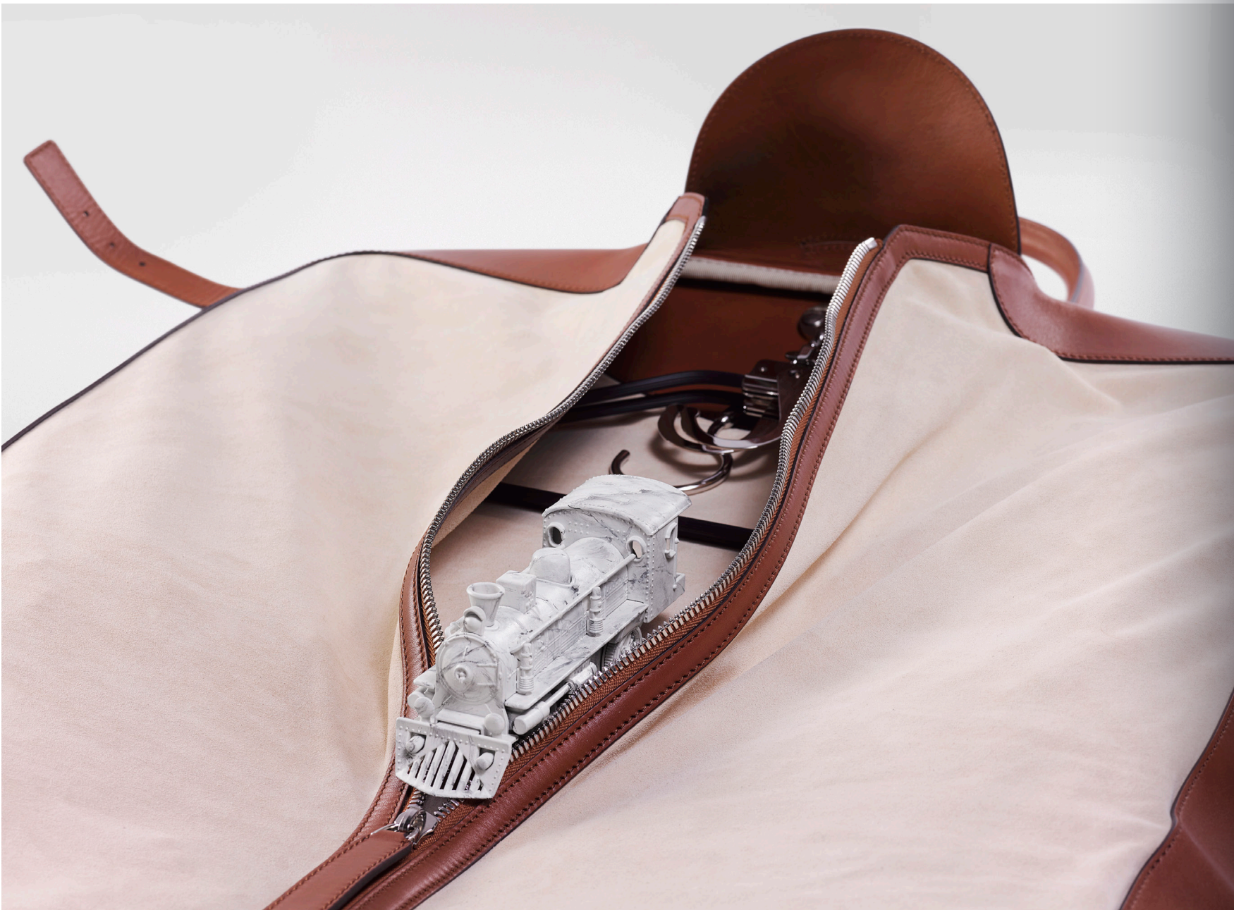
suit bag IN051