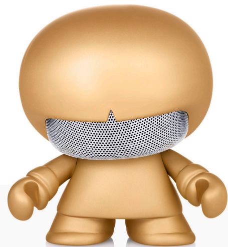
this page: wireless bluetooth speaker IN035 • wireless bluetooth speaker IN024 opposite page: speaker IN025