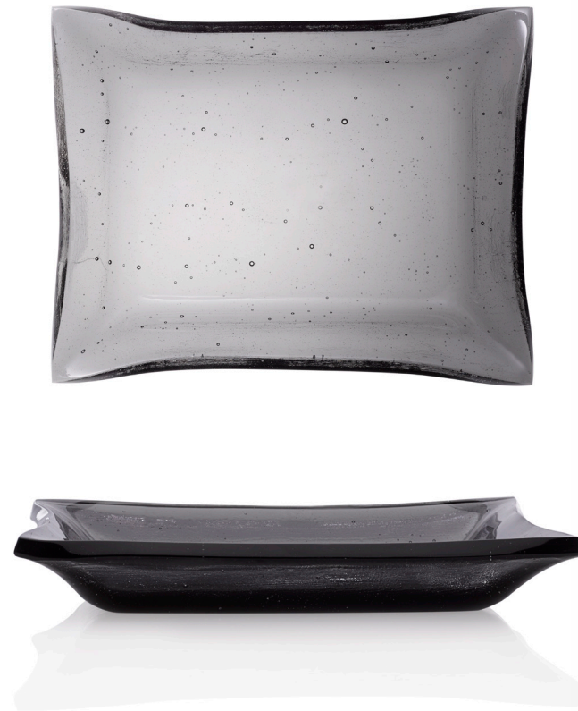
this page: blown glass ashtray IN005 opposite page: blown glass ball IN001

For those familiar with high-quality luxury goods, there is a tangible feeling attached to a product produced by the hands of a skilled craftsman. IN/EDIT continues the legacy of fine Swiss handcrafting by working with skilled craftsmen who bring with them generations of manufacturing know-how.