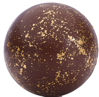
this page: chocolate coffee stirrer IN021 • chocolate ball w/ gift inside IN006 opposite page: scented candle in display case